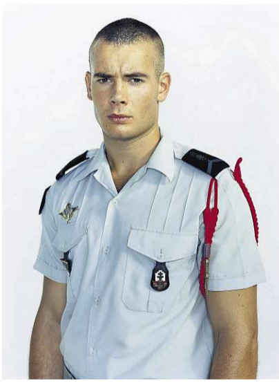
RINEKE DIJKSTRA/BANK OF AMERICA MERRILL LYNCH COLLECTION

Portraits and Power: People, Politics and Structures. Strozzi Center of Contemporary Culture. Palazzo Strozzi, Florence. Through Jan. 23.